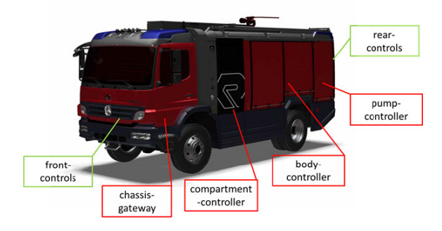
Figure 3: typical electronics distribution for municipal vehicle

Many different fire department manufacturers place the control architecture in accordance with this spatial division.