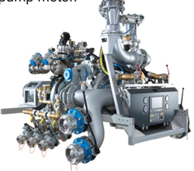
Figure 4: Extensive pump unit

The pump is the actual centrepiece of the fire-fighting truck. The pump itself is largely driven via the power takeoff, since the power requirement is quite significant. Of course there are also solutions using a separated pump motor.