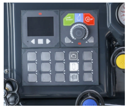
Figure 7: Operation via CAN key pane

This divide, of course, causes problems for superstructure manufacturers, lower quantities per implementation and thus higher costs. The age pyramid within the fire department also plays a role: that which is cool and absolutely necessary for some is seen by other users as an unnecessary gimmick. An increasingly noticeable trend is the use of key panels connected by way of CAN, key banks and small, compact display units. Therefore, simple vehicles as well as those with a complex functional scope can be easily mapped by increasing the number of control panels.