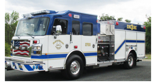
Figure 2: USA vehicle

Once an original owner decommissions a vehicle, it is typically refurbished and will be used by the next owner for many years to come. The higher-guality the vehicle, the more frequently this method is used, especially for turntable and aerial ladders. Fire-fighting trucks are subject to very rigid regional standardisation in many countries. Even the average layman can recognize the big hemispheres of the USA and Europe, which utilize completely different vehicle concepts and operational tactics. The result is that vehicles utilize drastically different operations, lights, weights, electronics and technology, with the exception of a few large-scale productions.