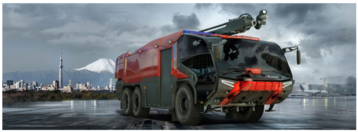
Figure 1: 3-axle ARFF vehicle with boom (HRET)

Fire-fighting trucks are needed in truly precarious situations, regardless of whether it's a fire fighting or rescue operation. The vehicles and, therefore, the installed electronics systems as well, have low operating hours. During an operation, 100% availability is vital in the truest sense of the word. The variance of the vehicles is tremendous, no two vehicles are the same (aside from rare large-scale productions).